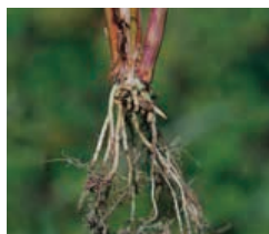
Johnsongrass - Roots ( Sorghum halepense )