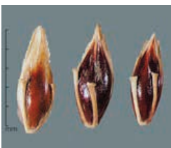
Johnsongrass - Seeds ( Sorghum halepense )