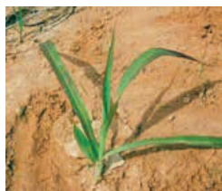
Johnsongrass - Seedling ( Sorghum halepense )