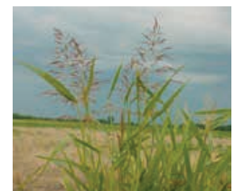
Johnsongrass - Plant ( Sorghum halepense )